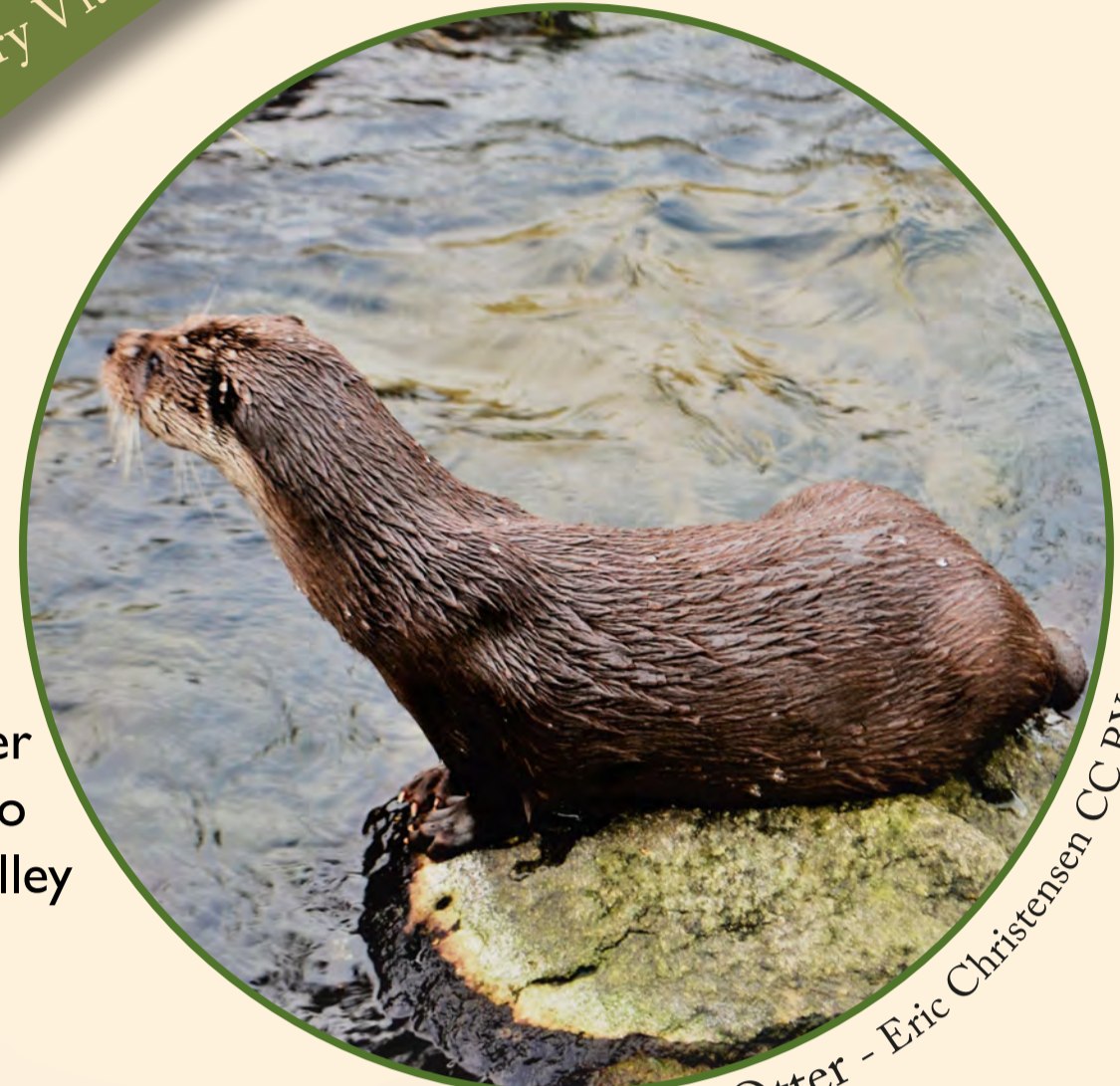
The Eurasian Otter ( lutra lutra ) can also be found in the Valley