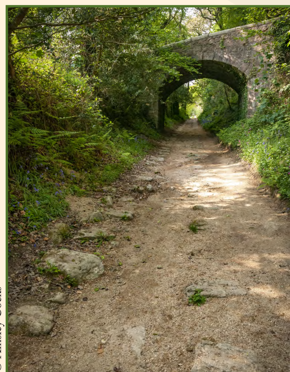
The Carmears Inclined Plane