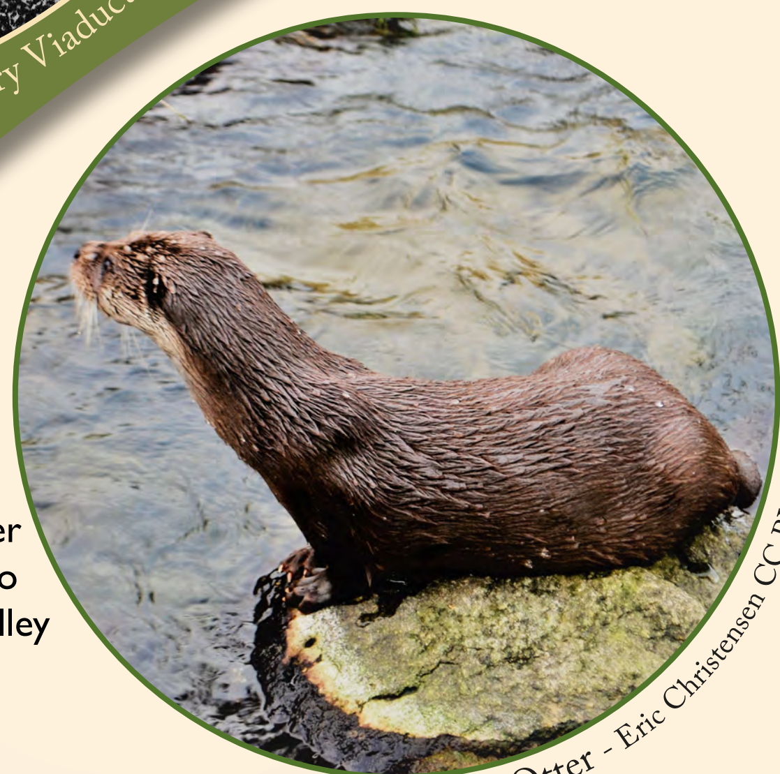
The Eurasian Otter ( Lutra lutra ) can also be found in the Valley