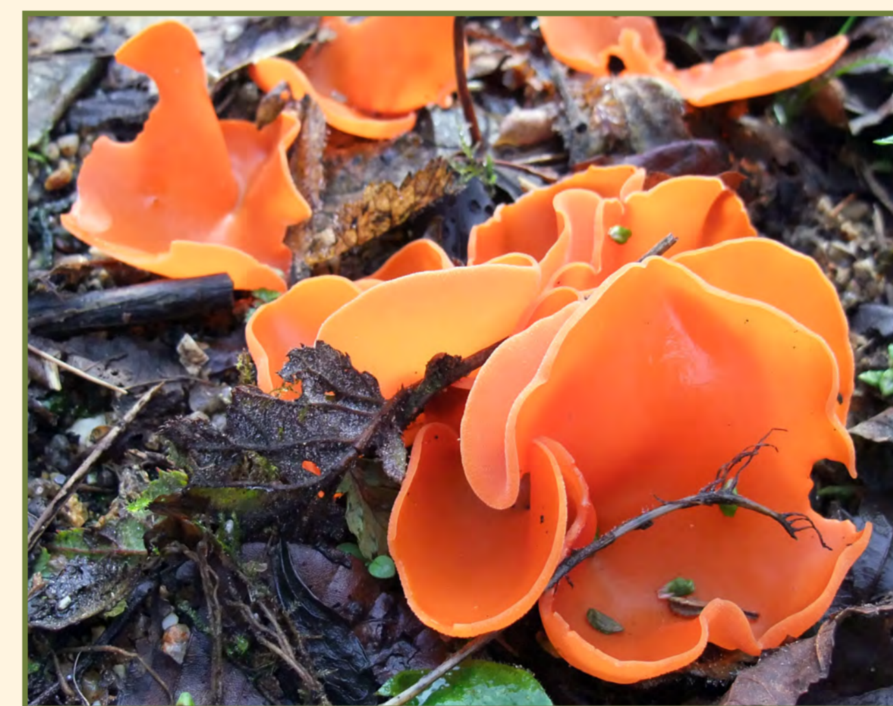
Orange Peel Fungus (Aleuria aurantia), one of the more colourful species present in the Valley

The Valley is classified as a County Wildlife Site, owned and managed by Cornwall Council with the help of a dedicated group of volunteers. The leats are repaired and vegetation is carefully managed to support wildlife whilst protecting the industrial remains.