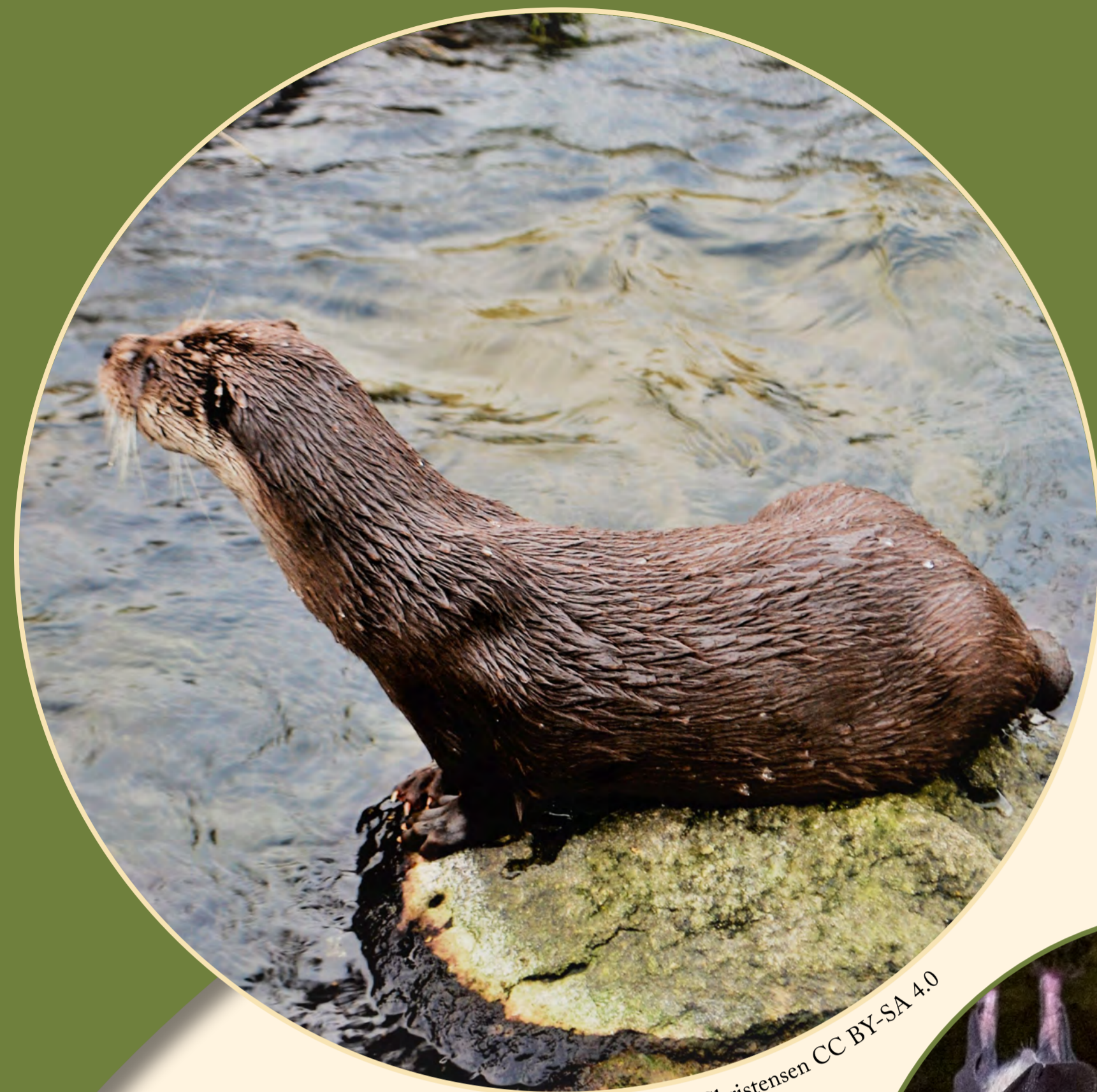
Eurasian Otter

Most of the Luxulyan Valley is deciduous woodland, including a large area of ancient oak, with Ash, Beech, Sycamore, Holly, Hazel and Elder.