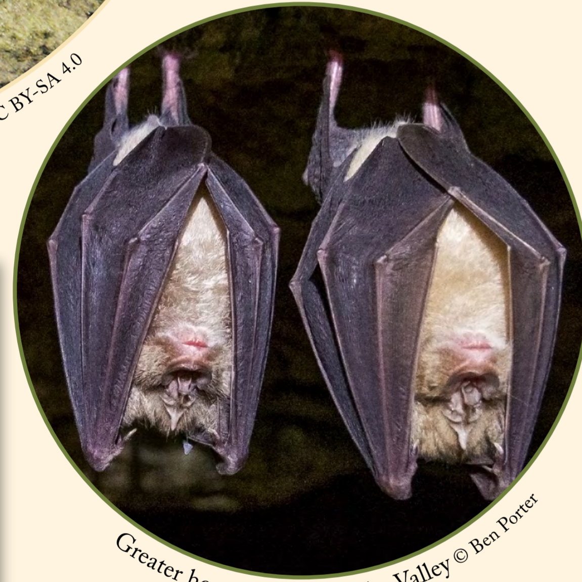
Greater horseshoe bats in the Valley

It also shelters a wide range of other plants and animals, including protected species such as bats, otters and dormice. A greater horseshoe bat colony lives here at Trevanny Dry.